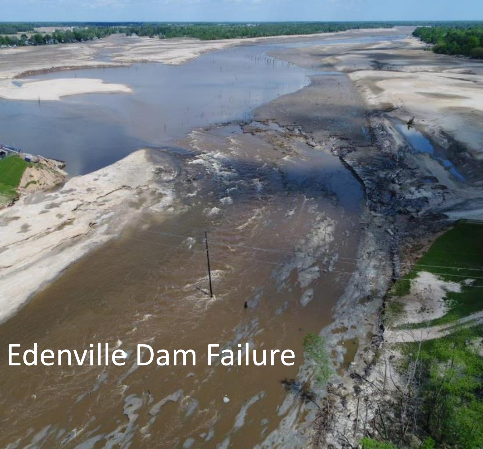
Edenville Dam Failure